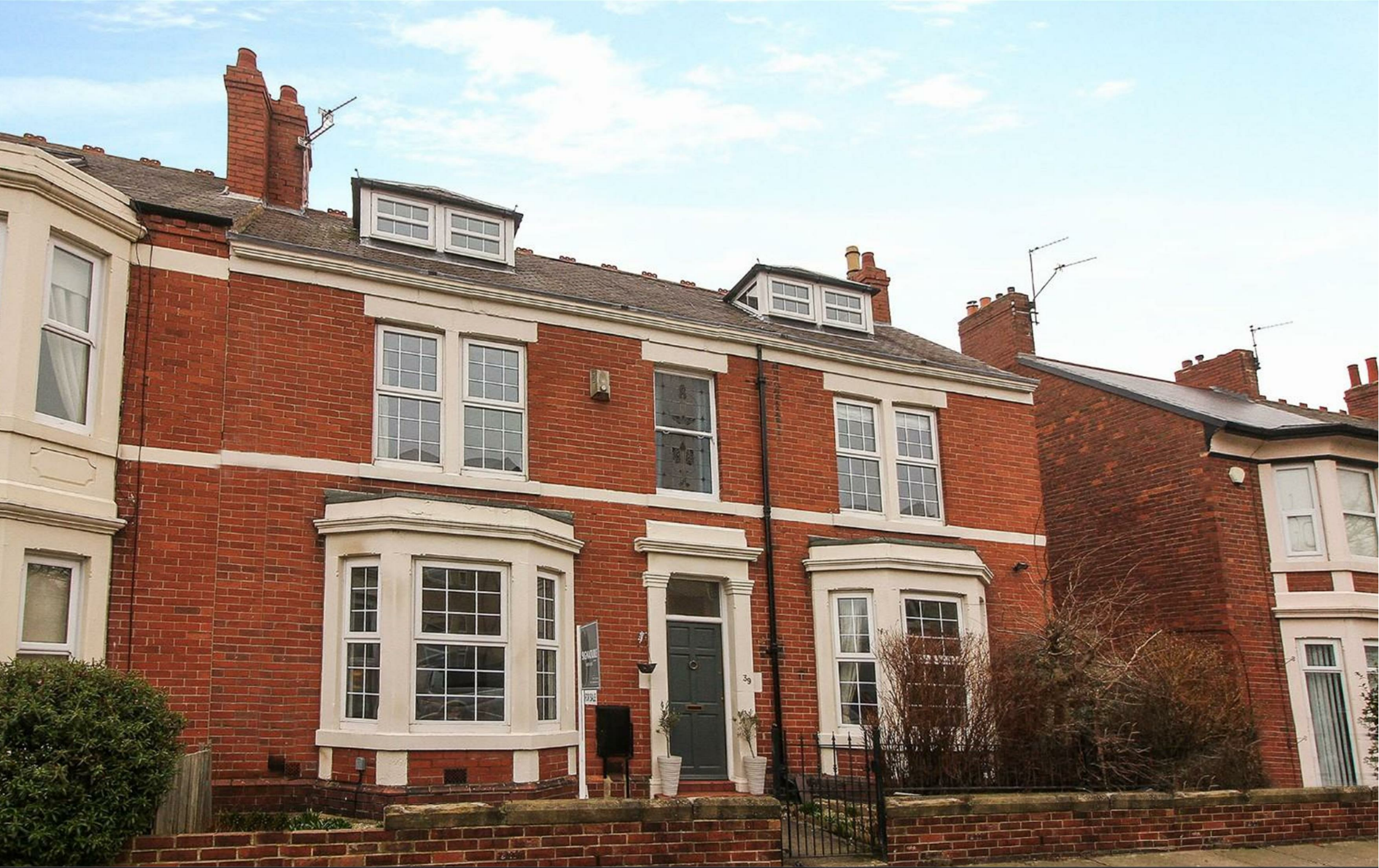
📍 Washington Terrace, North Shields NE30 2HJ